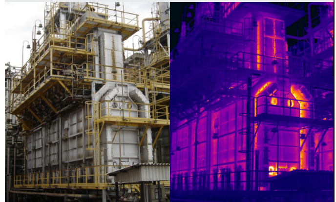
Thermal imaging of the external surface of the firebox shell and flue ducts can identify areas of overheating due to internal refractory damage.

Equipment described herein is subject to US export regulations and may require a license prior to export. Diversion contrary to US law is prohibited. ©2019 FLIR Systems, Inc. All rights reserved. 06/19 - 18-2923-INS